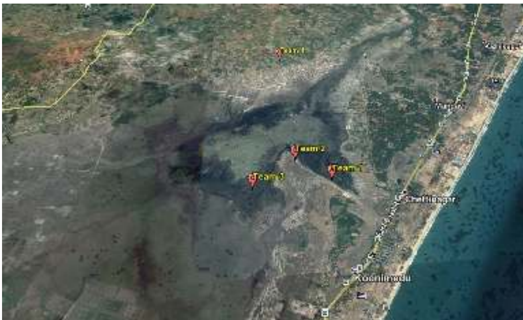
Location of the counts at Kalivelli.

Located just ## km North of Pondicherry town and just south of the town of Marakannam, Kalivelli is a designated bird Sanctuary and wetland covering about 40 sq.km. Kalivelli lies in the Villupuram district of Tamil Nadu. The fresh water lake receives water from a chain of minor irrigation tanks in largely agricultural watersheds which is discharged into the Ediyanthittu estuary via a thin neck called the Uppukalli creek. The vegetation around the wetland comprises tall reeds and grasslands. There are agricultural fields further into the periphery of the lake and small patches of native tropical dry evergreen forests either in reserve forests or sacred groves. Students from Pondicherry University, Gandhi Higher Secondary School Thiruchtrambalam Kootroad, Volunteers from Auroville and members of FERAL took part in surveying four regions of the wetland.