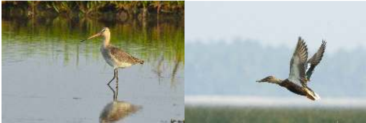
Black Tailed Godwit (left) and the Northern Shoveller, in Kaliveli.

A total of 48 species were observed of which the most individuals comprised of Northern Shoveler ( Anas clypeata ) followed by Spot-billed Pelican ( Pelecanus philippensis ), Intermediate Egret ( Mesophoyx intermedia ) and Painted Stork ( Mycteria leucocephala ). Given the sheer size of the wetland, these observations comprised of individuals within a few hundred metres of the bird watchers. There were carpets of ducks and flamingos out of the range of the binoculars which were not included into the count.