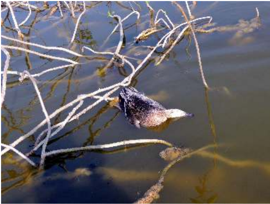
A dead spot billed duck, probably drowned by a fishing net left overnight. The fisherfolk collect their nets and catches in the morning, throwing the dead birds aside.