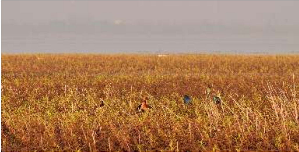
Mixed flock in Ousteri lake.

A total of 28 species of birds were observed at Ousteri, where the count was limited to the eastern edge of the lake due to fewer participants. Most of the individuals recorded were Black-winged Stilt, Purple Swamphen ( Porphyrio porphyrio ) and Little Egret ( Egretta garzetta ). The bird count was led by volunteers from Auroville and students from Pondicherry University with other participants from FERAL and a few school students.